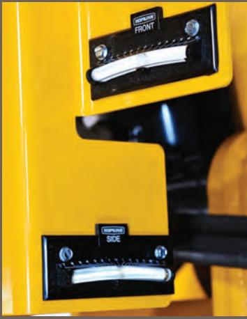
Two quick-read, numbered, leveling indicators to plumb posts.