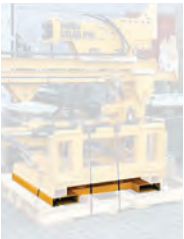
Metal Fork Pallet Kit - Safely transport your CEA with a forklift.

Versatility from one unit - Multiple Adapters to provide efficient driving of piles/post/beam up to a maximum footprint of 8" x 7.25" (20.3 x 18.4cm), and maximum height of 8.5' (21.59 cm) tall.