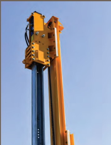
Accommodates guardrail posts (piles) up to 8.5' (2.6m) tall.