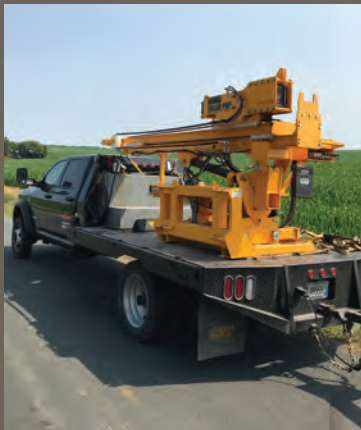
Easily transport company owned, or rental, hydraulic operated equipment (skid steer or loader) and CEA.