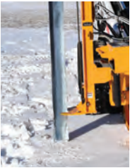
Bottom Guide secures Pile - Custom sizes and shapes available.