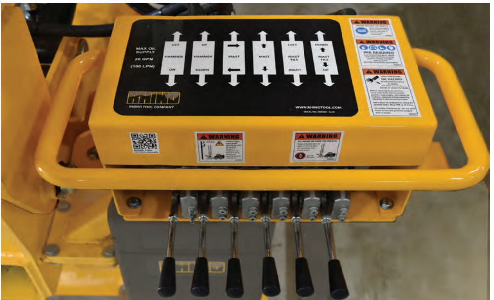
Omni Directional Adjustment for precise positioning and leveling of the pile and to accommodate for Uneven Terrain