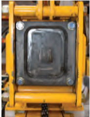
Removable adapter plate, shown above. Custom sizes and shapes available.